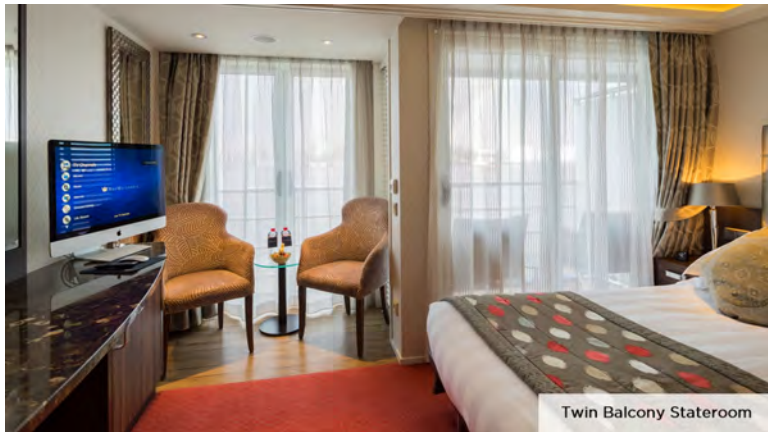
Twin Balcony Stateroom